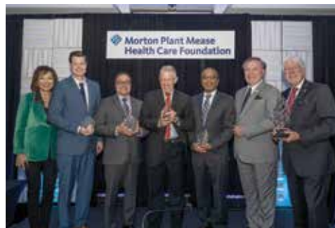
A focal point of the Annual Meeting is presenting the Distinguished Physician Leadership Awards and Golden Flame Philanthropy Award.