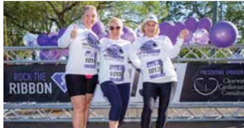
Runners and walkers battled the bridge at our Rock the Ribbon 5K, 10K and Kids Dash benefiting the comprehensive cancer care programs at the hospitals of Morton Plant Mease.