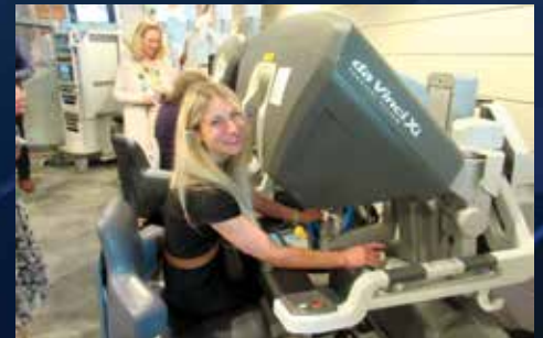
The women's symposium featured a "sip and see," highlighting past awarded grants, including the da Vinci® Surgical System.