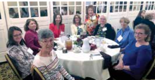
The Morton Plant North Bay Hospital Women in Philanthropy chapter participated in a lunch and learn at the Spartan Manor to hear updates on the impact of their grant funding.