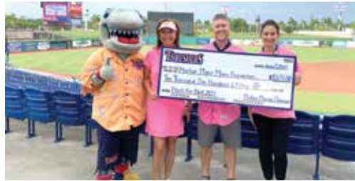
The Clearwater Threshers helped us strike out breast cancer at the 17th annual Pitch for Pink baseball game at BayCare Ballpark, raising $10,650 to benefit our hospitals' breast health services and programs.