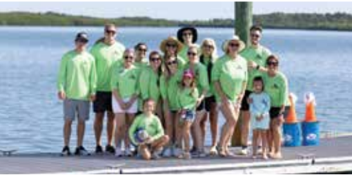
The Skip Cline Society hosted their 12th Annual Seawall Rodeo and Inshore Fishing Tournament at the Carlouel Yacht Club to help raise funds for pediatric programs at the hospitals of Morton Plant Mease.

Philanthropy is based on voluntary action for the public good. Gifts from individuals, corporations, foundations and organizations have a profound impact on the ability of our hospitals to carry out their mission. We appreciate the generosity of all community members who have helped support our fund-raising events over the past year. These events present an opportunity to not only raise important funds, but bring greater awareness to the programs we support.