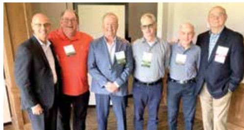
Members of the Meri's Giving Circle gathered at the East Lake Woodlands Country Club for their annual voting meeting where they collectively voted to grant $70,000 to the hospitals this year.